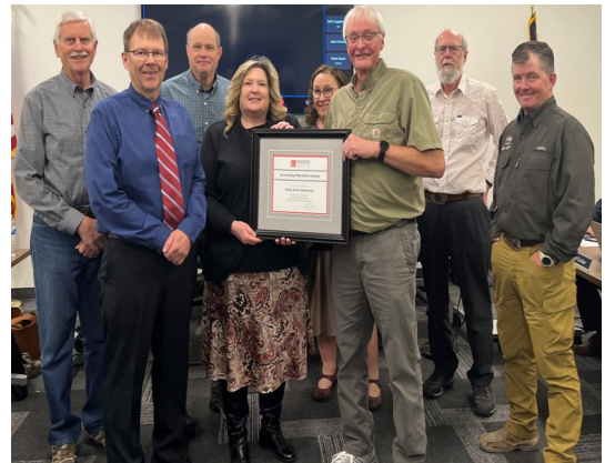
The IPELS board and ISU Representatives

"We applaud the program's commitment to preparing students for professional practice and continued commitment to promoting licensure." - NCEES