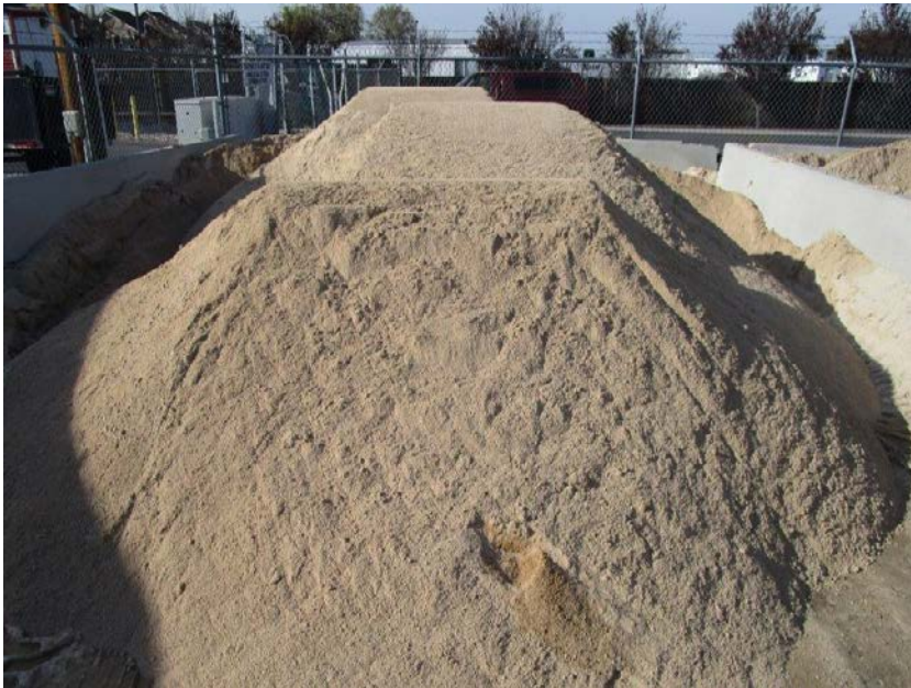
Approved (No Aggregate)